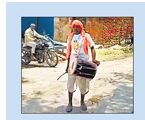
A drum-beater deployed to carry weather warnings.

(WITH INPUTS FROM PRAYAGRAJ, VARANASI, GORAKHPUR, AGRA AND MEERUT)