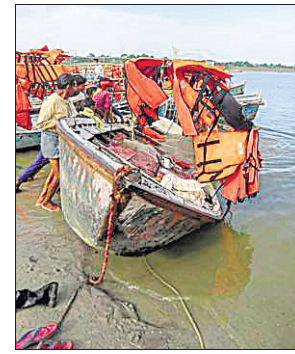
Boatmen try to recover a boat in Ganga following strong wind and rain at the bank of Sangam, in Prayagraj.

The storm also claimed the life of a 55-year-old labourer in