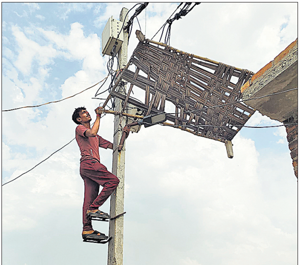
(Top) A man passes a damaged electric pole after a late-night storm in Lucknow on Friday. Residents claimed that despite repeated complaints to the electricity department, no repair crew had arrived, while live wires hanging in the area continued to pose a major safety hazard. (Above) In Jalaun, a charpoy blown away by the storm got lodged in an electric pole.