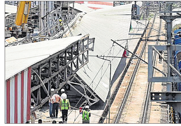
The portion of a tin shed that collapsed at Charbagh railway station in Lucknow on Friday.